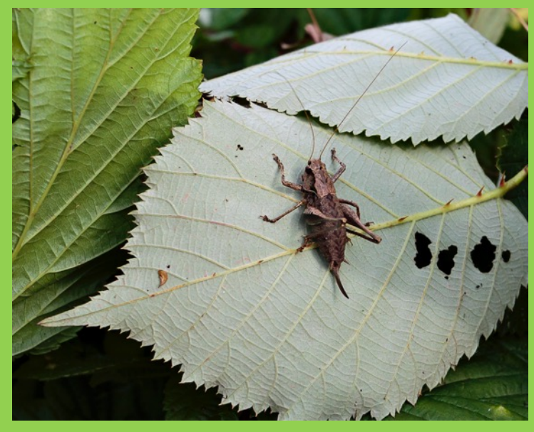
Dark Bush cricket.